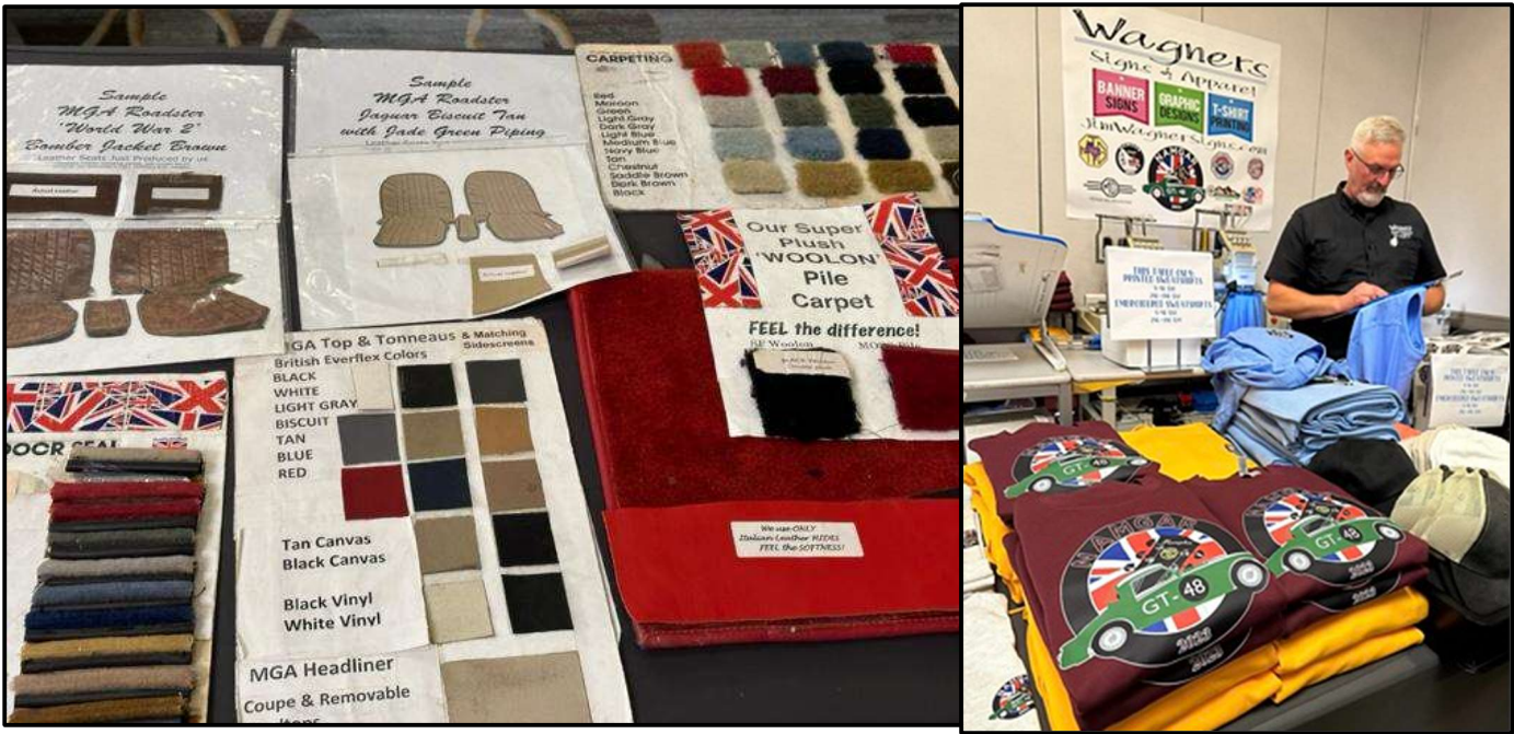
--car show at Edge museum