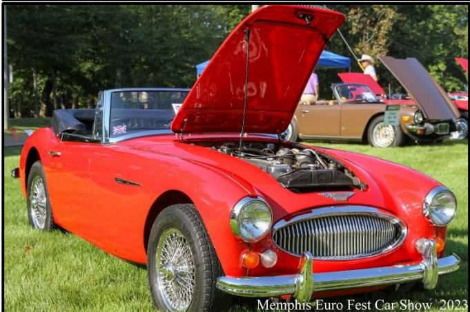
Memphis Euro Fest Car Show 2023