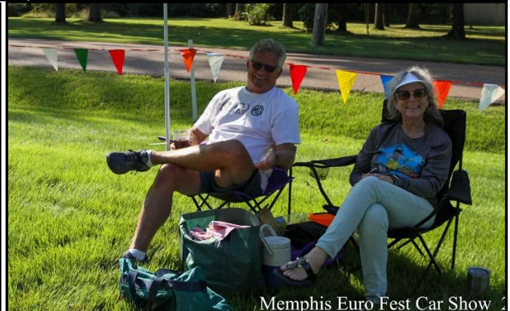
Memphis Euro Fest Car Show 2023