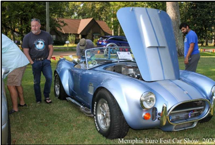
Memphis Euro Fest Car Show 2023