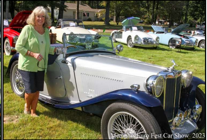
Memphis Euro Fest Car Show 2023