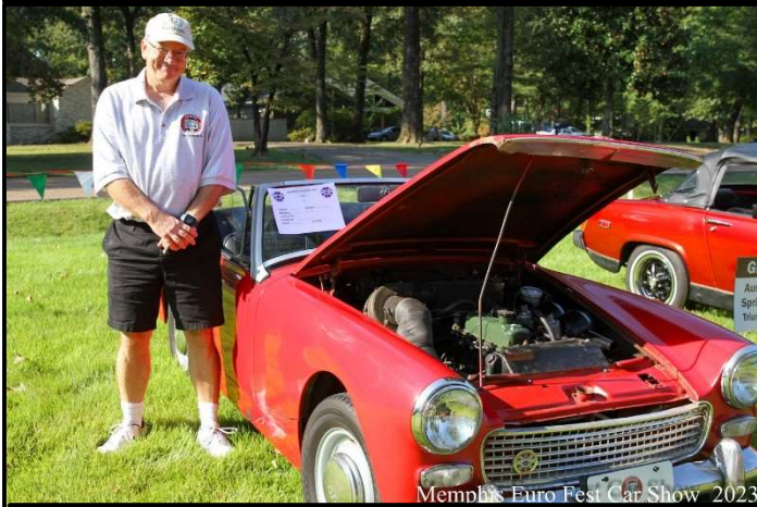
Memphis Euro Fest Car Show 2023