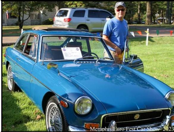
Memphis Euro Fest Car Show 2023