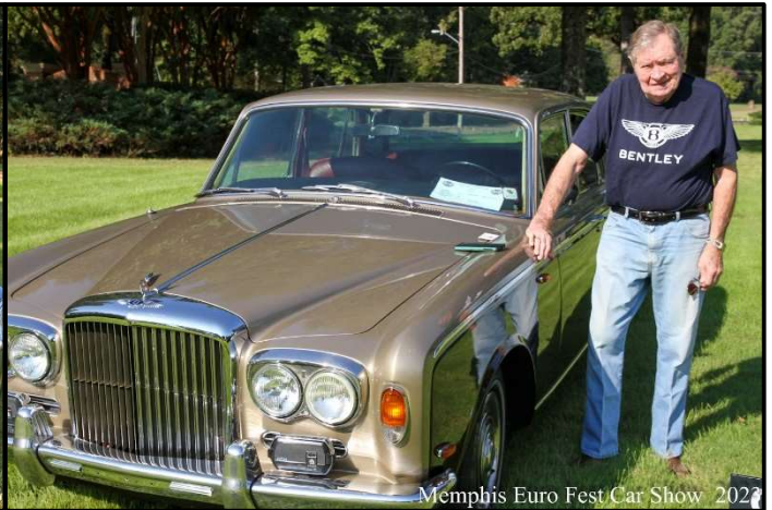
Memphis Euro Fest Car Show 2023