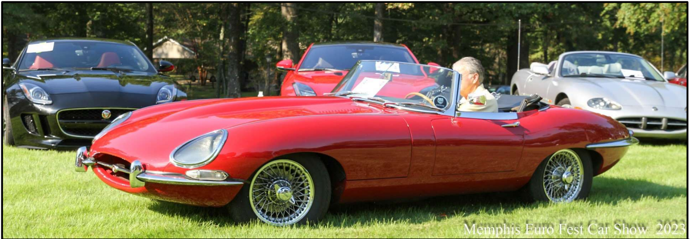
Memphis Euro Fest Car Show 2023