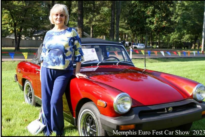
Memphis Euro Fest Car Show 2023