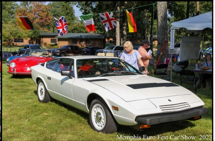
Memphis Euro Fest Car Show 2023