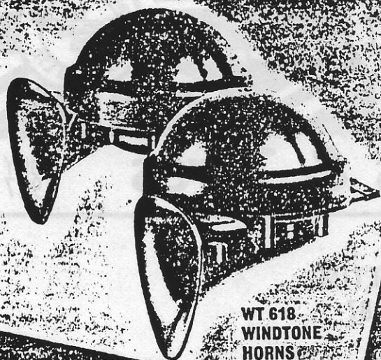
WT 618 WINDTONE HORNS