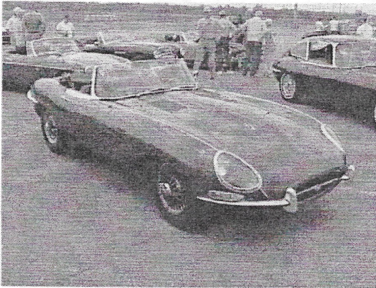
Walt Fisher's '64 E-type at the Agricenter